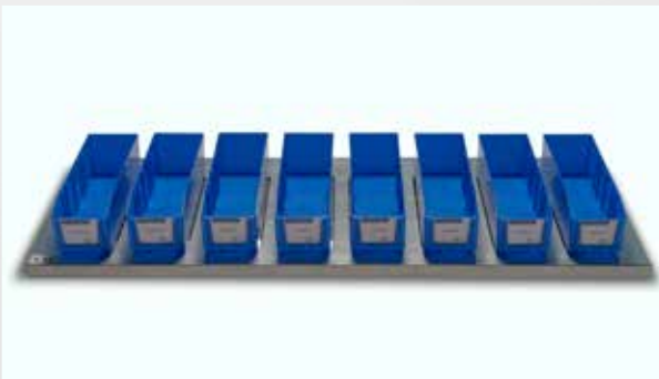
Shelf variant with storage boxes 8 x 4kg