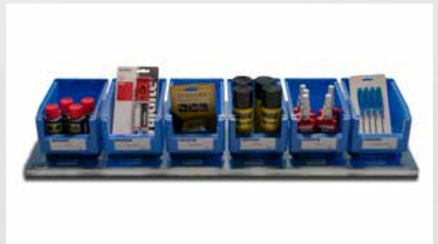
Shelf variant with storage boxes 6 x 4kg