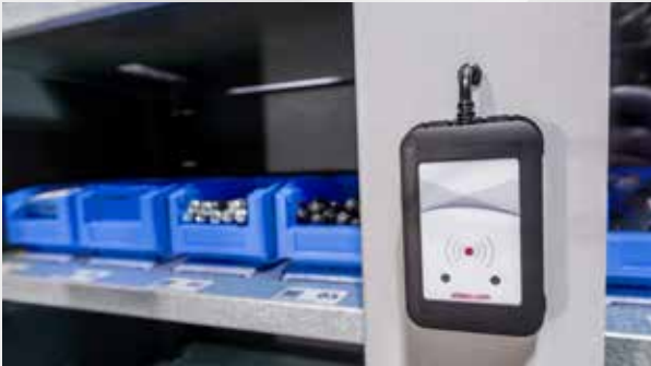
Reader for authentication available for stand-alone units