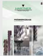
▼ SOLID CARBIDE MILLING CUTTERS