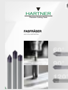
▼ CHAMFERING MILLING CUTTERS