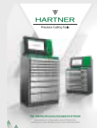
▼ TM VENDING MACHINES