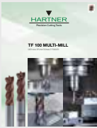
▼ TF 100 MULTI-MILL