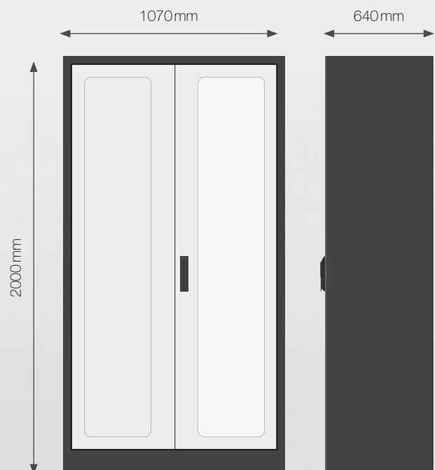
TM 626 without viewing window | front and side view