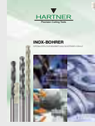
▼ INOX DRILLS