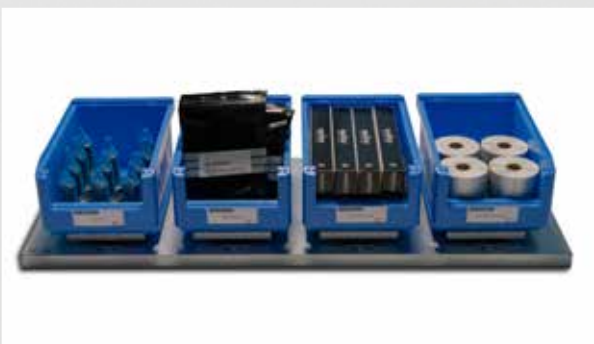
Shelf variant with storage boxes 4 x 20kg