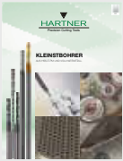
▼ MICRO-PRECISION DRILLS