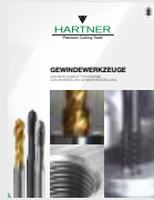
▼ THREADING TOOLS