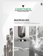
▼ MULTIPLEX HPC