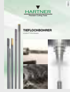
▼ GUN DRILLS