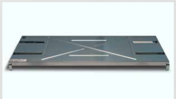
Shelf variant 1 x 80kg