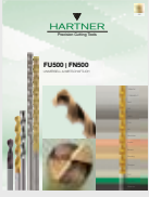
▼ FU 500 / FN 500